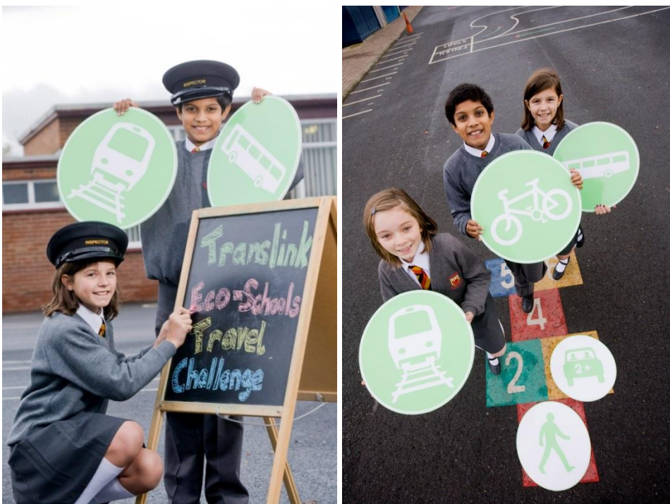
Antrim Primary School Pupils help launch the 2012 Travel Challenge

We have taken part in the Translink Eco-Schools Travel Challenge for the past three years.