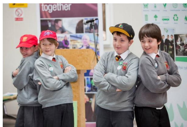
Pupils also performed their rap at the Translink Travel Challenge Award ceremony 2013