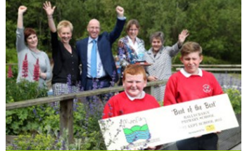
Ballycraigy Primary School, Antrim, last year's winners of the 'Best of the Best' award.

Do you have school grounds and buildings that are beautifully kept with a great environmental focus and enthusiastic, involved pupils? Almost 200 schools entered last year's 'Best Kept' School Awards, which are run by the Northern Ireland Amenity Council. The competition encourages both staff and pupils to work together to improve the school's environmental surroundings.