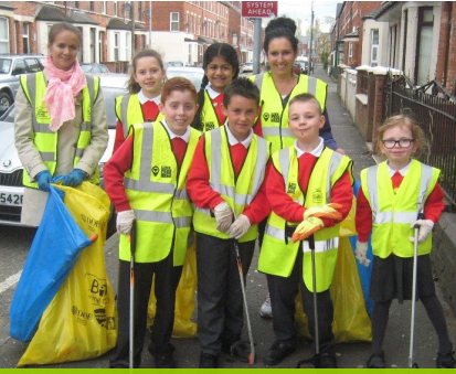
Holy Family Primary School, Belfast, taking part in BIG Spring Clean 2015.

Last year over 90,000 people showed that they love where they live, work and learn by getting involved in the BIG Spring Clean, picking litter from their beaches, streets, countryside and school grounds – making them cleaner and tidier for us all to enjoy!