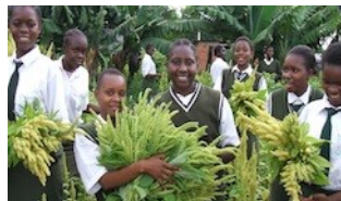
Pupils from Goibei High School enjoy harvesting their crops.

The school has a student population of about 700 pupils, 40 teachers and about 10 non-teaching staff. With these numbers the Eco-Schools programme has benefited not only the school but also the surrounding community.