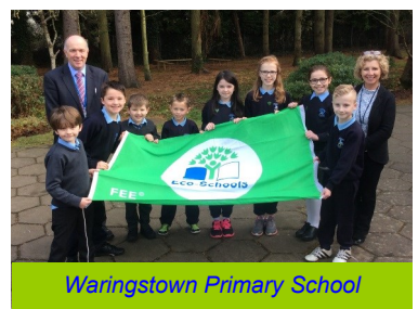
Waringstown Primary School