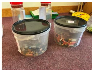
CLASS BOXES COLLECTED AT THE END OF EACH MONTH....

As a school we effectively use Class Dojo and the school website and facebook to communicate with the school and wider community. Their feedback and interest and support is invaluable. Parents and members of the wider community generously support all our fundraising initiatives, most recently our Fair Hill hits the road tractor run and family fund day. Primarily our school's eco initiatives are now well publicised and the BIG birdwatch, Energy week and recycling are especially enjoyed by all. Parents, neighbours and family members donate unwanted clothing and shoes for our Cash4Clobber collections. This ongoing support plays a vital role in helping us promote sustainability and raise funds for our eco projects.