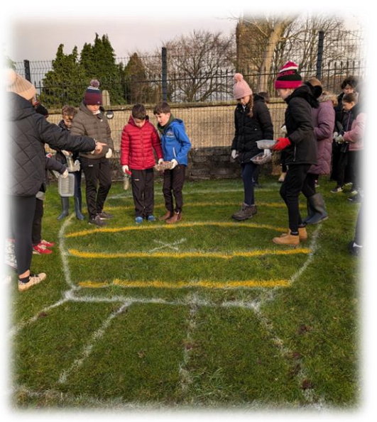
Bulb planting in BalGlen Project