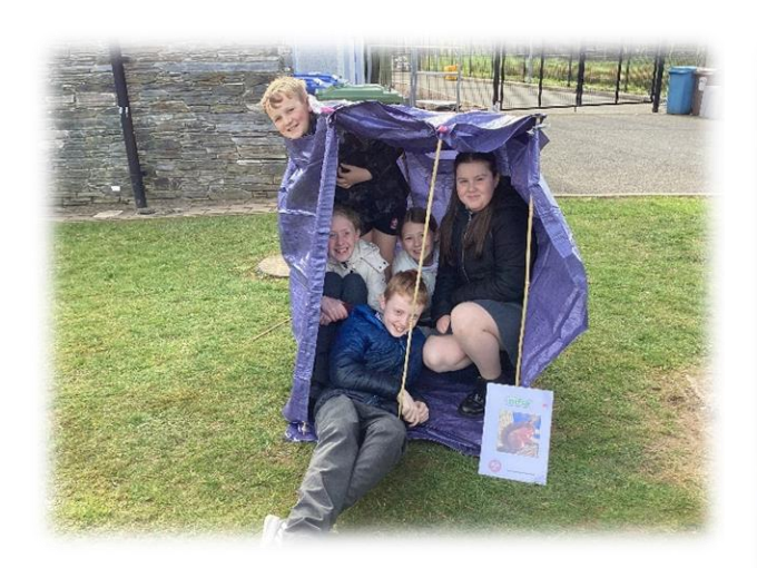
Making shelters in Forest Schools

We helped mentor some of our Screen Eco-Schools partners and our Shared Education partner to their first flags. This involved helping with action plans, planning activities and initiatives and helping to obtain relevant resources.