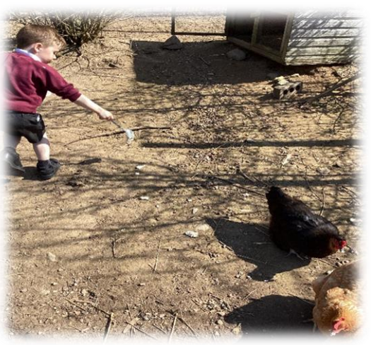
Feeding the chickens